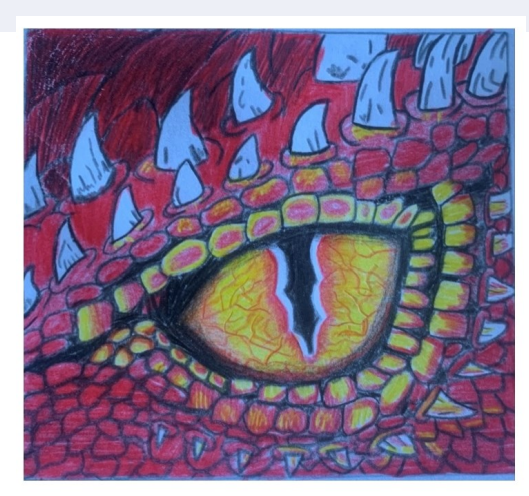
Dragons Eye, Colour Pencil, By Chloe