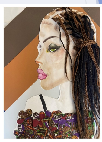
Imose (Beauty), Mixed Media, By Ellia