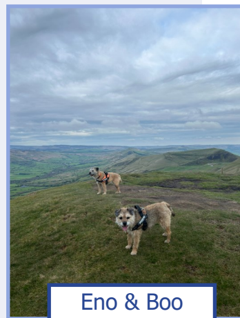
Eno & Boo