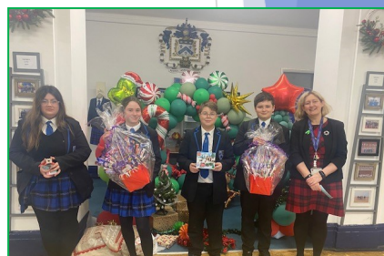
Raffle Prize Winners