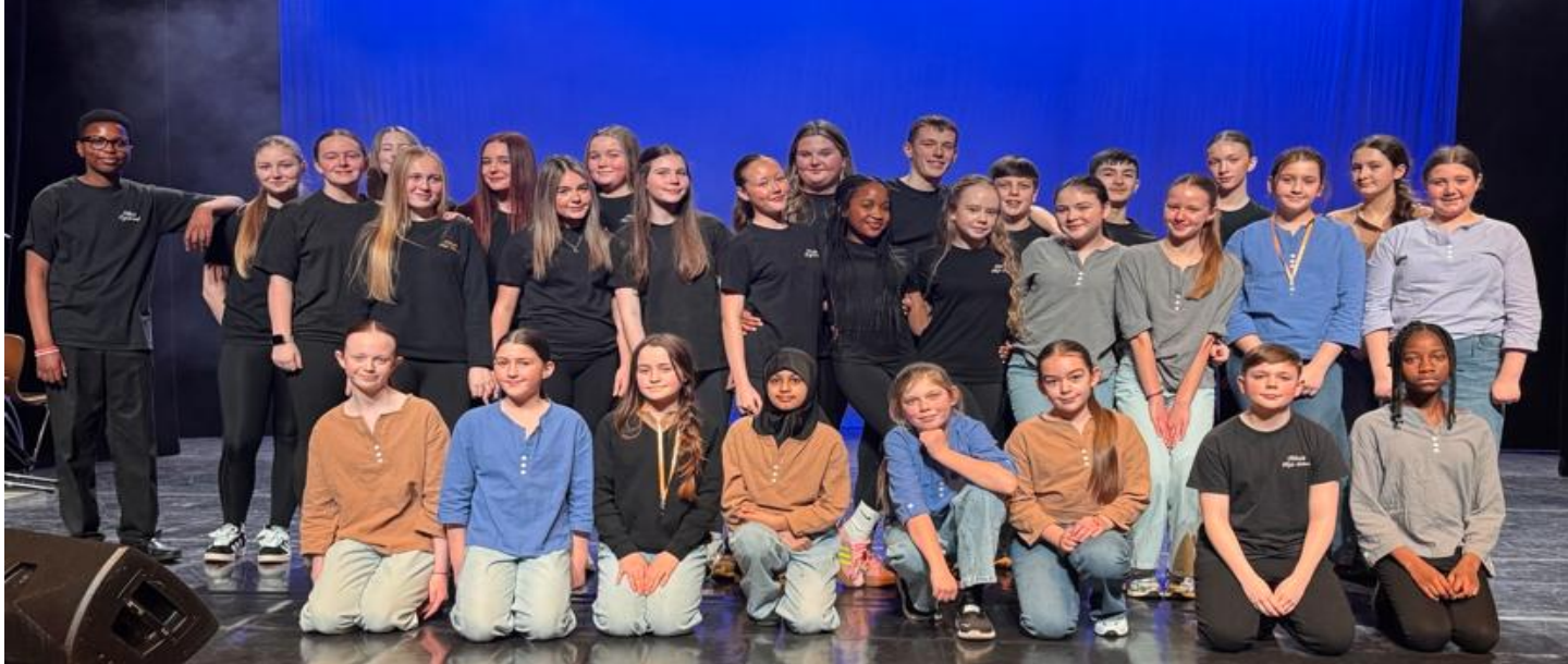
Round of applause for LIPA- Fest!