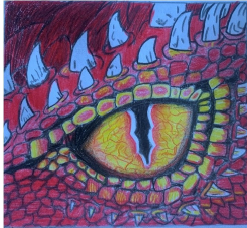
Dragons Eye, Colour Pencil, By Chloe