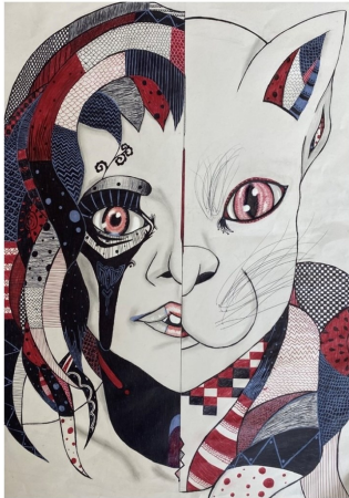
Feline Traits, Pen & Pencil, By Eleanor