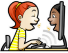
A Parent's Guide to Social Media